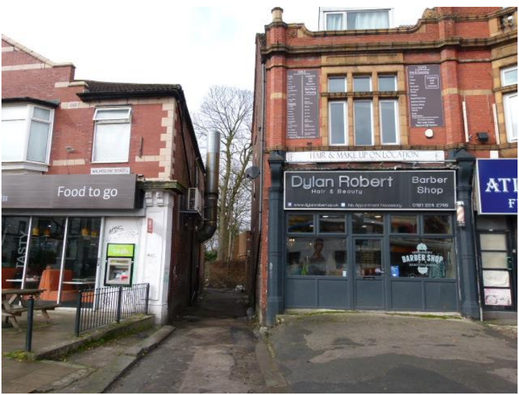
Front elevation and alleyway to the side

Other commercial units in the parade comprise of 2no. hot food takeaways, a café, estate agents and a student bar with health club above. In front of the site is a deep tarmac forecourt adjacent to the pedestrian footpath. A bus stop with services from South Manchester is located a few metres away and a traffic-light controlled crossing is a few metres to the south. At the rear of the site is Morris Court, a supported housing block of flats for vulnerable adults. Immediately south of the unadopted alleyway is a hot-food takeaway with a McDonalds drive-through and sit in restaurant to the south of that.